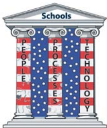
Building Strong PEOPLE, PROCESSES, and TECHNOLOGY Pillars